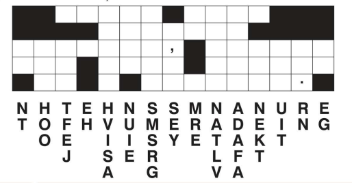
Copyright © 2019 by Standard Publishing. Permission is granted to reproduce this page for ministry purposes only. Not for resale. Reproducible Student Activity Page 487

We have a problem: the enemies of the ultimate servant, Jesus, have tried to destroy one of the most important descriptions about him. Your task is to reconstruct that description using the grid below. Each letter can be used only in the vertical column directly above it, and each letter must be used. Do so, but don't put any letter in the two boxes with punctuation marks.